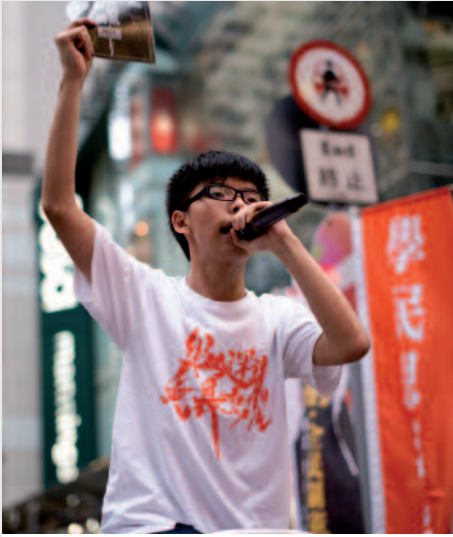
JOSHUA WONG: STUDENT DEMOCRACY, PEACEFUL RESISTANCE