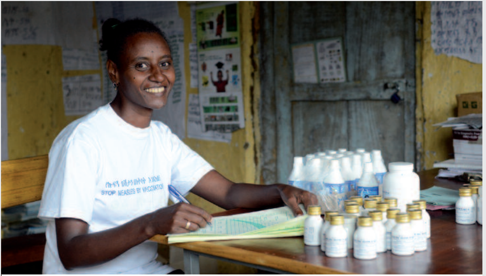
DAMENECH DANSA: NURSE PUBLIC HEALTH ACCESS AND EDUCATION