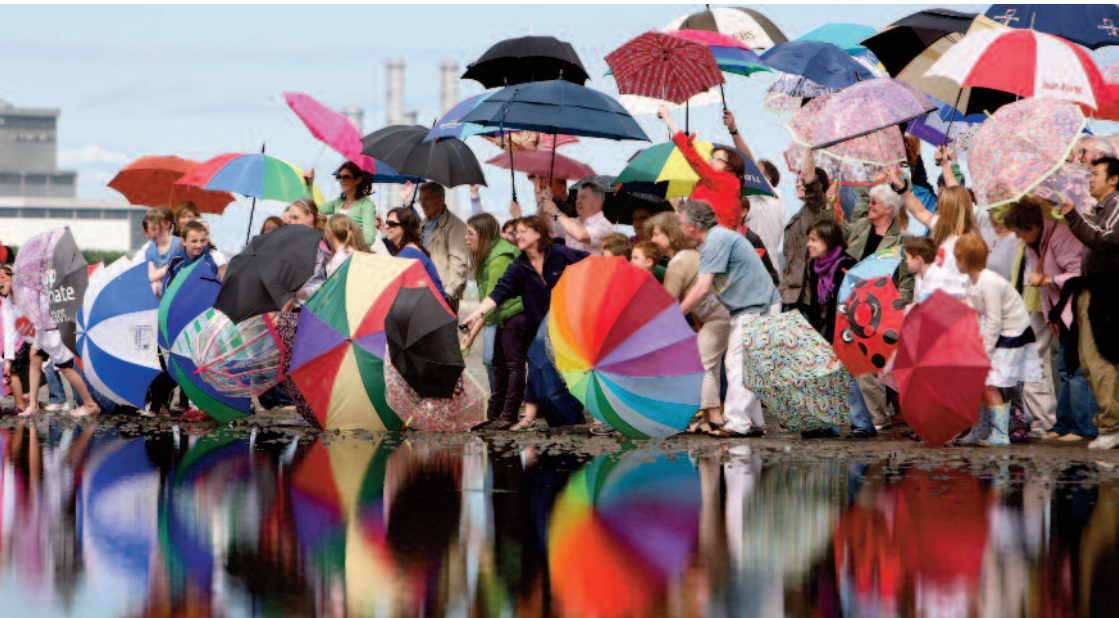
Members of the public during Umbrella Action Day at Sandymount Strand, Dublin. Umbrella Action Day is a demand to the government to act on climate change. Photo: Gareth Chaney Collins (2008)

Despite what is often stated and believed, change, big and small is an everyday occurrence and most often comes about because of ‘activism’ in many different shades and types.