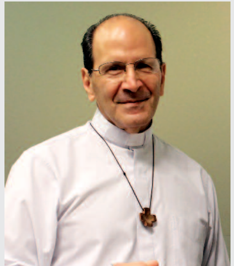
ALEJANDRO SOLALINDE: PRIEST BASIC NEEDS OF EMIGRANTS, HUMAN RIGHTS